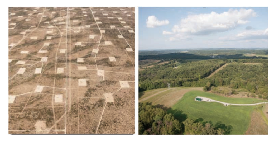
Figure 2 Innovation in well design and operation. Left: old single well spacing (Texas); right: modern multi-well cluster configuration accessing gas from an area of up to 10 km<sup>2</sup> (Pennsylvania).

• the energy use and methane leakage associated with the transport of gas to Europe over long distances (up to 4000 km) from Siberia and Algeria is reduced.<sup>4</sup>