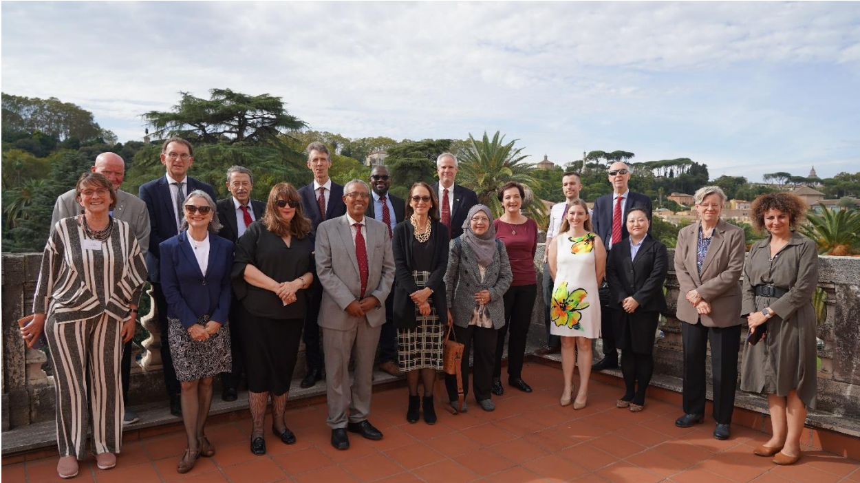
FIGURE 2 - THE IAP BOARD AND ADVISORY COMMITTEE MEMBERS MEETING IN ROME, ITALY, IN OCTOBER 2023.

The IAP's vision is for the world's academies to play a vital role in ensuring that advances in science, including social sciences and the humanities, 1 engineering and medicine, serve societies inclusively and equitably, and underpin global sustainable development. The IAP's dedication to equity, diversity and inclusivity is reflected in its leadership and the membership of its working groups and committees, and is embedded in the priorities of this Strategic Plan.