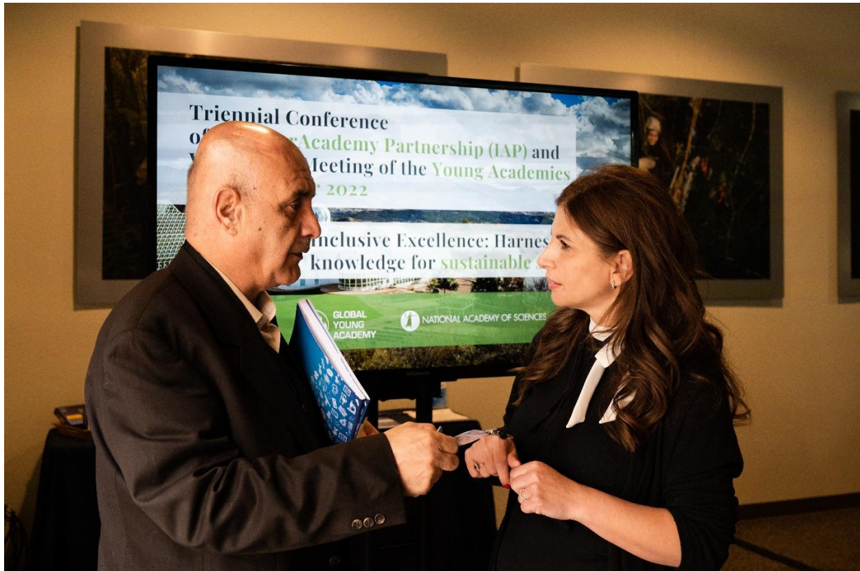
FIGURE 3 - THE TRIENNIAL CONFERENCE OF THE IAP AND THE WORLDWIDE MEETING OF THE YOUNG ACADEMIES IN ARIZONA, USA, IN NOVEMBER 2022.