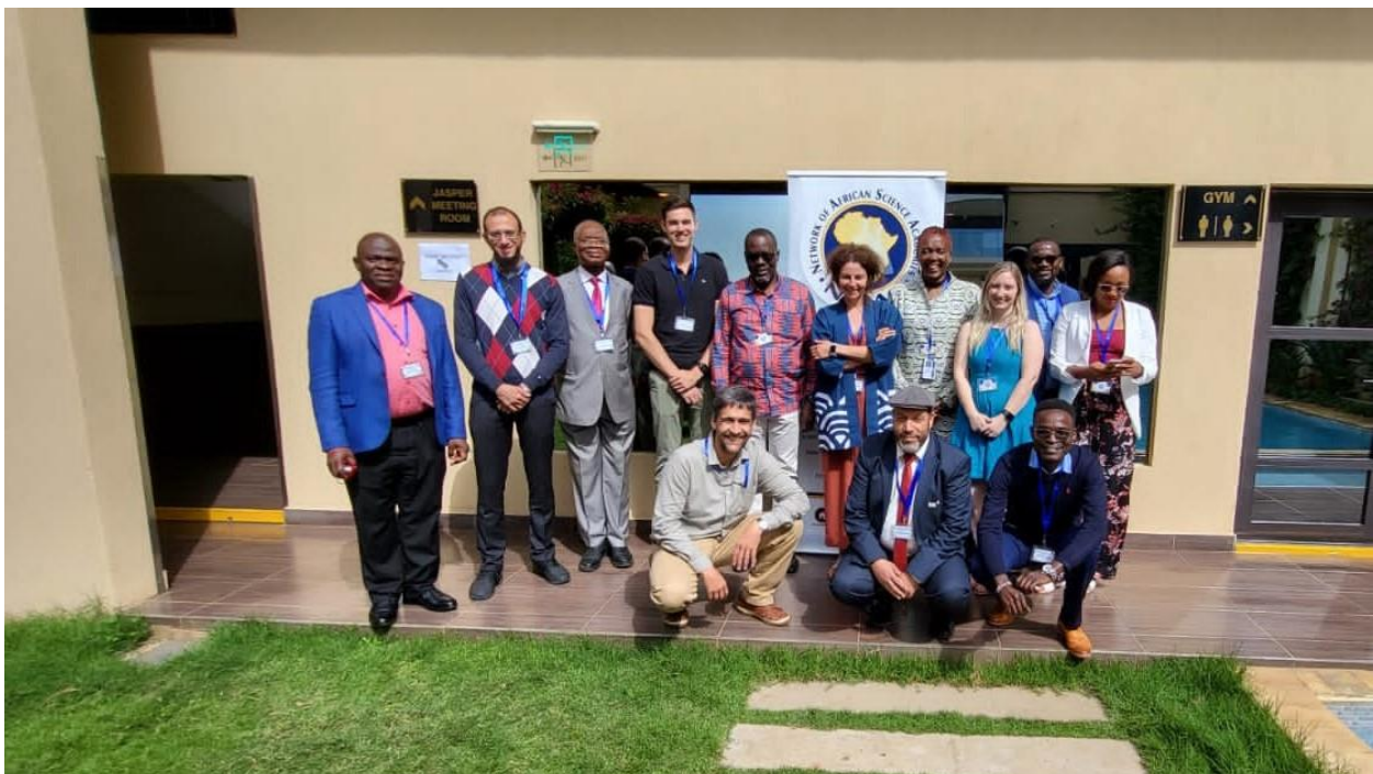
FIGURE 6 - THE WORKING GROUP OF THE IAP-NASAC PROJECT ON DECARBONISATION OF TRANSPORT IN AFRICA MET IN NAIROBI, KENYA, IN JUNE 2023.

The IAP took several steps over the duration of the previous Strategic Plan to become a more progressive and cohesive global academies network. Specifically, it revised its statutes and completed the merger process of its three constituent networks (IAP Science, IAP Health, and IAP Policy) to a single network that allows collaboration across multiple areas of expertise. IAP also strengthened its governance by establishing an Advisory Committee and three Programmatic and Development Committees that oversee capacity building, policy advice, and communication, education and outreach activities. Finally, the IAP improved the efficiency and effectiveness of the Secretariat operations and diversified its core resources.