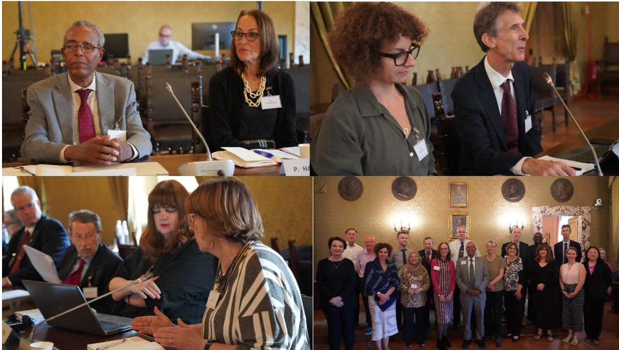
FIGURE 4 - THE IAP CO-PRESIDENTS, STAFF AND ADVISORY COMMITTEE MEMBERS GATHERED IN ROME, ITALY, IN OCTOBER 2023.

The IAP's governance provides the supportive organizational structure to implement this Strategic Plan. Much of the work called for by the Strategic Plan will be implemented by the IAP's three Programmatic and Development Committees that oversee capacity building, policy advice, and communication, education and outreach activities. These committees, with representation of more than 30 IAP member academies around the world, will develop specific approaches to meet the objectives under each set of priority goals of the Strategic Plan, the means to advance the plan through the IAP membership and the metrics for measuring success of approaches and progress towards meeting the goals. Approaches will be adaptable to changing factors and local contexts and will be realistic relative to the mission and size of the IAP. The IAP Board and staff members will serve as liaisons to the three Programmatic and Development Committees and ensure adherence to tasks and timelines.