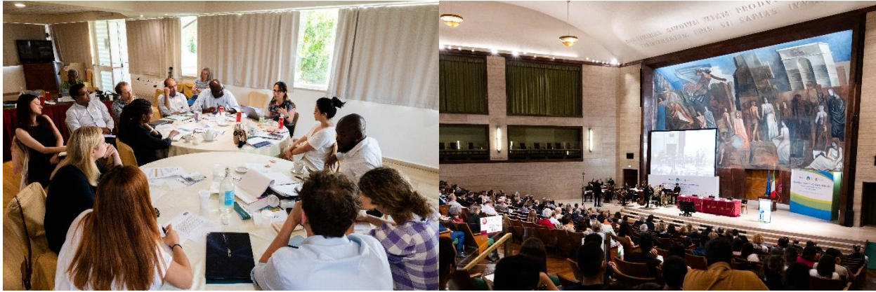
FIGURE 5 (LEFT) – THE 2022 YPL COHORT DISCUSSING LEADERSHIP STYLES IN ROME, ITALY, IN JUNE 2022.