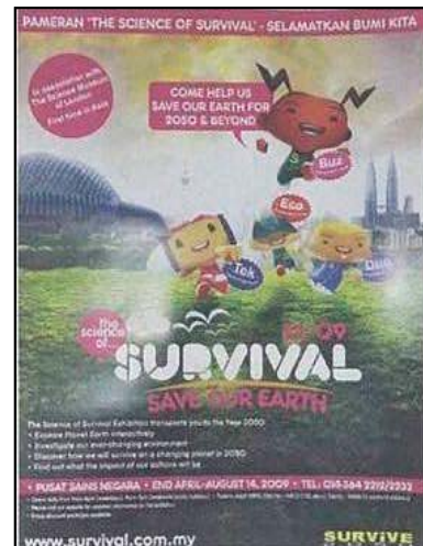
THE SCIENCE OF SURVIVAL – 2010 FROM LONDON SCIENCE MUSEUM