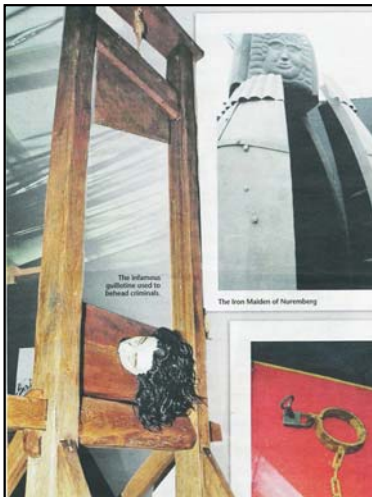
TORTURA – 2003 & 2011 FROM ITALY