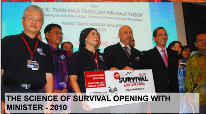
THE SCIENCE OF SURVIVAL OPENING WITH MINISTER - 2010