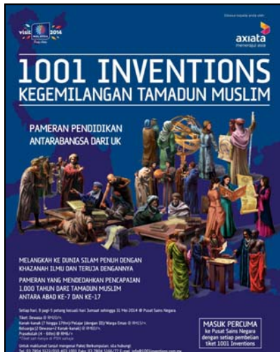
1001 INVENTIONS – 2013 – 2018