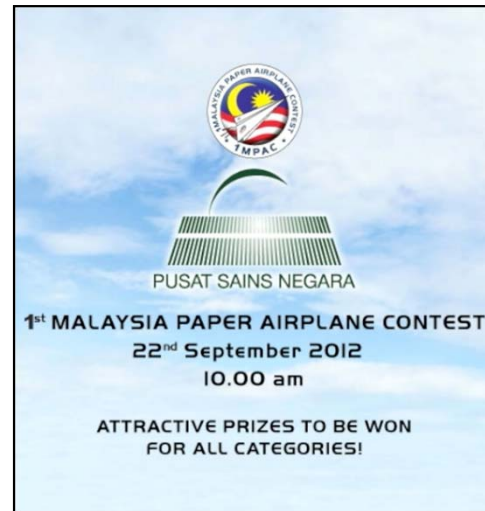
PAPER AIRPLANE CONTEST 2014