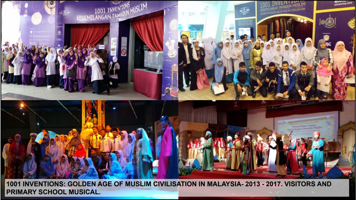
1001 INVENTIONS: GOLDEN AGE OF MUSLIM CIVILISATION IN MALAYSIA- 2013 - 2017. VISITORS AND PRIMARY SCHOOL MUSICAL.