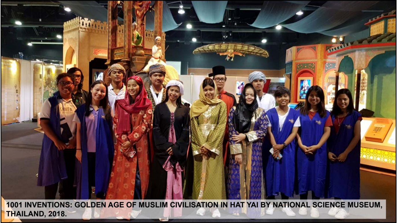
1001 INVENTIONS: GOLDEN AGE OF MUSLIM CIVILISATION IN HAT YAI BY NATIONAL SCIENCE MUSEUM, THAILAND, 2018.