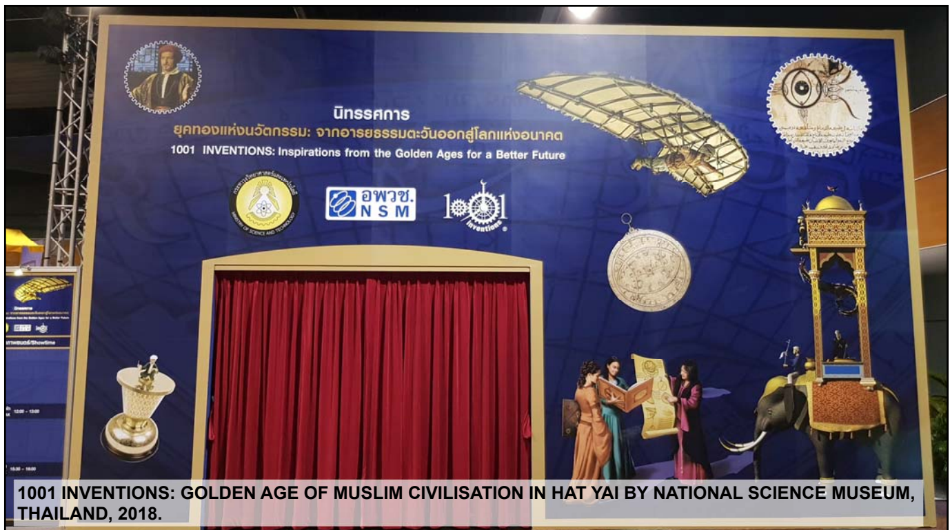
1001 INVENTIONS: GOLDEN AGE OF MUSLIM CIVILISATION IN HAT YAI BY NATIONAL SCIENCE MUSEUM, THAILAND, 2018.