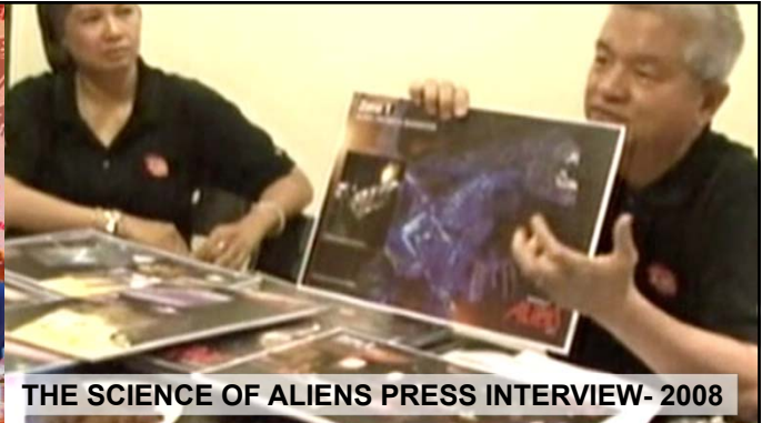
THE SCIENCE OF ALIENS PRESS INTERVIEW- 2008