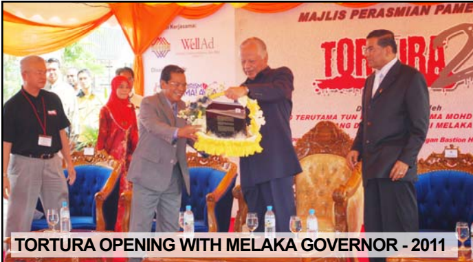
TORTURA OPENING WITH MELAKA GOVERNOR - 2011