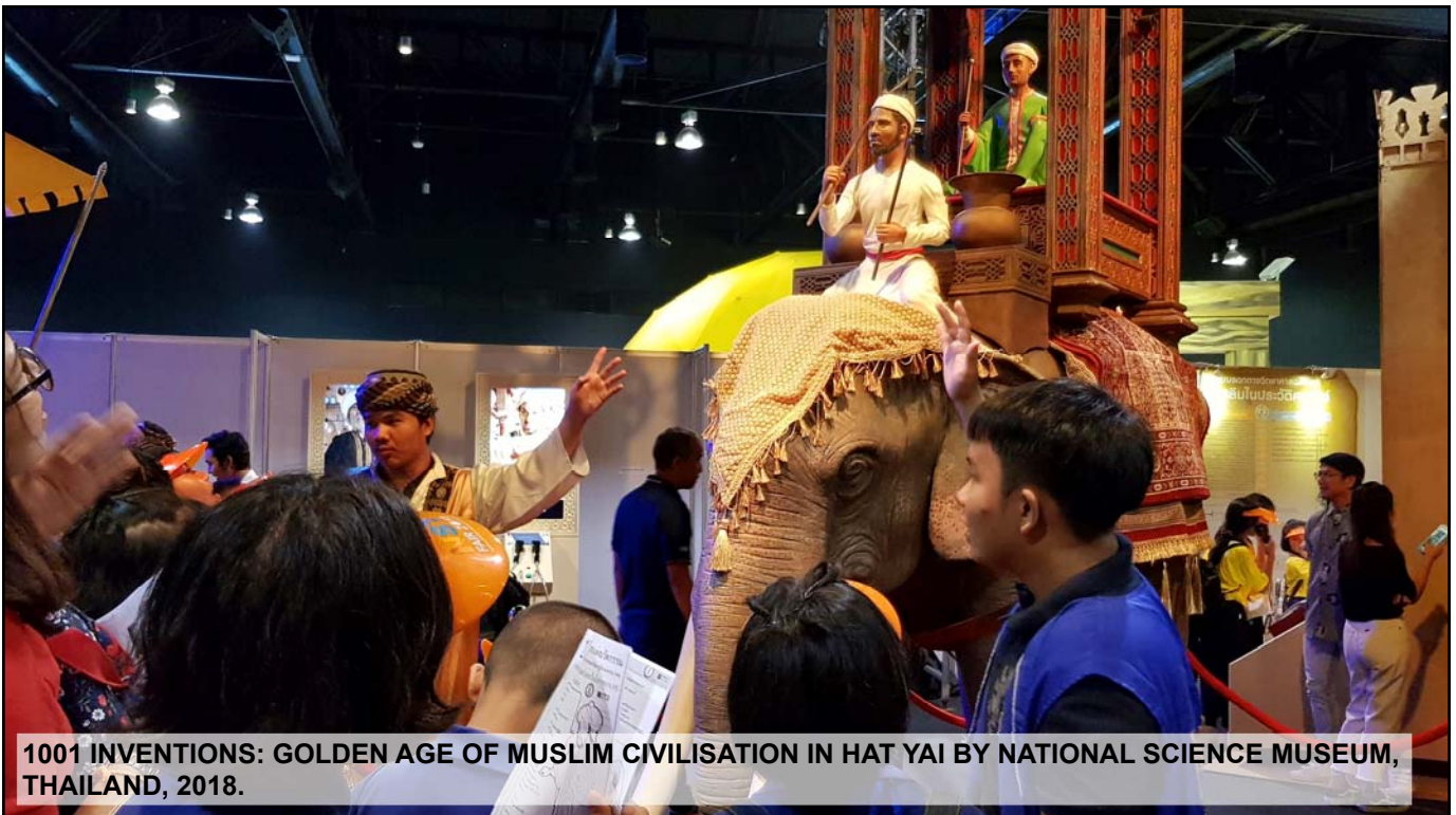
1001 INVENTIONS: GOLDEN AGE OF MUSLIM CIVILISATION IN HAT YAI BY NATIONAL SCIENCE MUSEUM, THAILAND, 2018.